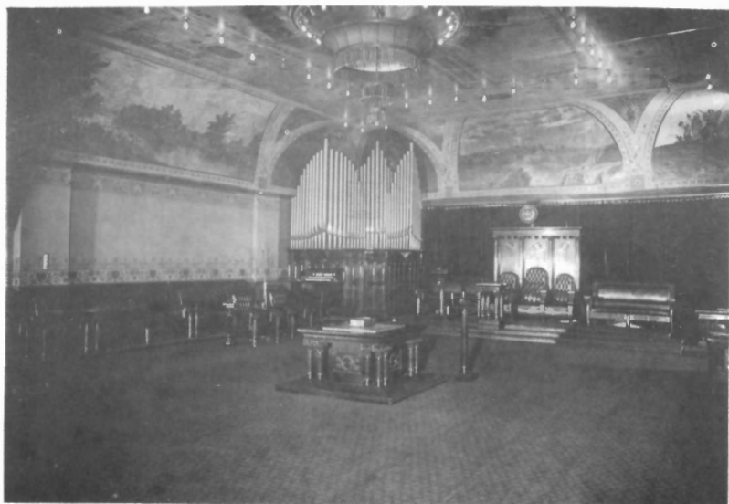
OLD LODGE ROOM