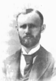
FREDERICK G. NOVY 1897