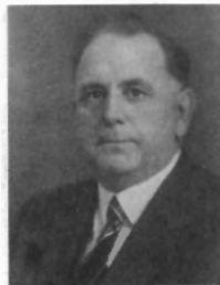
WILLIAM H. MURRAY 1910