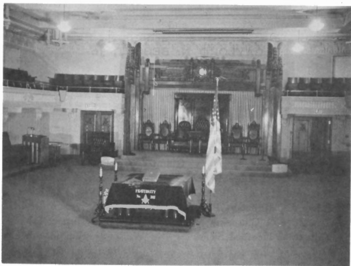
PRESENT LODGE ROOM